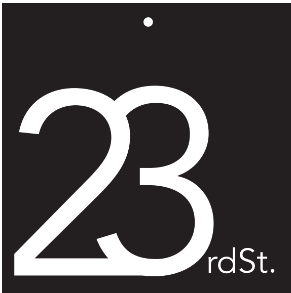
Woman's Hangtag 3" x 3" Hole Top Center