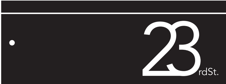
Men's Hangtag 1.5" x 4" Hole Left Center

209 East 56th Street, Suite 2E, New York, NY 10022 • Tel: 212-308-5019 Fax: 212-2078250 E-mail: platinumls@cs.com